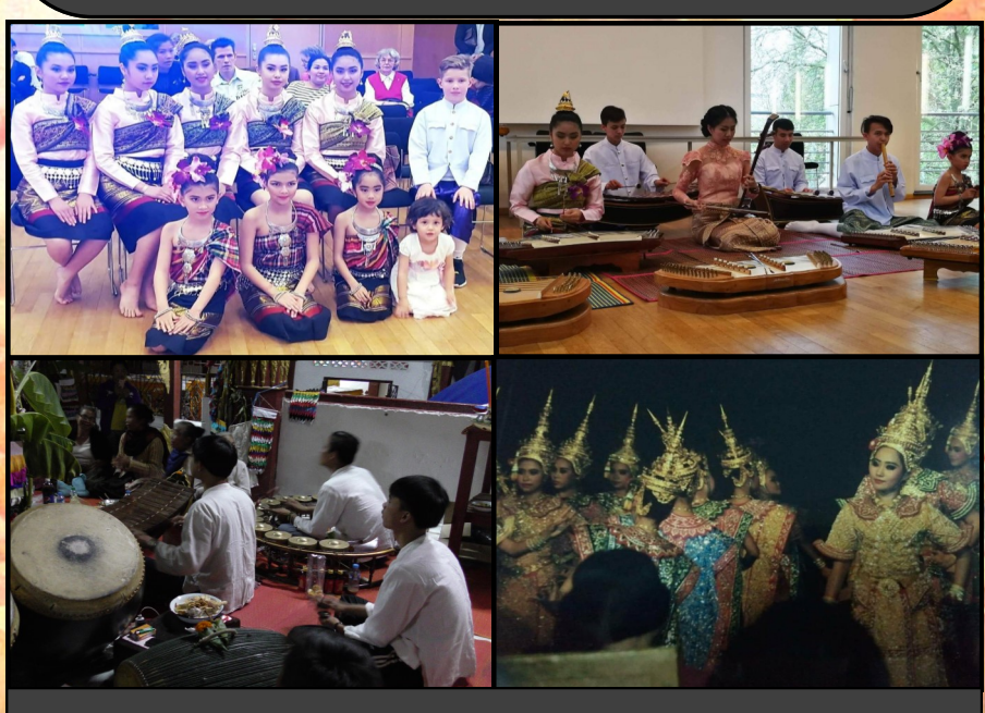
16:15-17:10, Room 221

Thai Instrumental Music and Dances Thailand NIE.LC. Hamburg